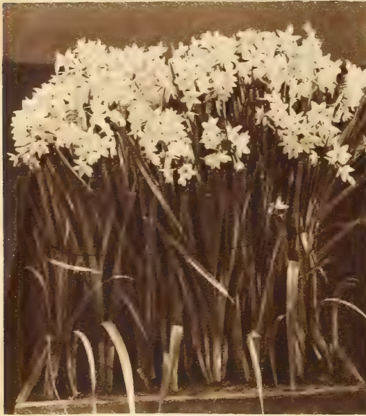
LARGE FLOWERING PAPER WHITE NARCISSUS